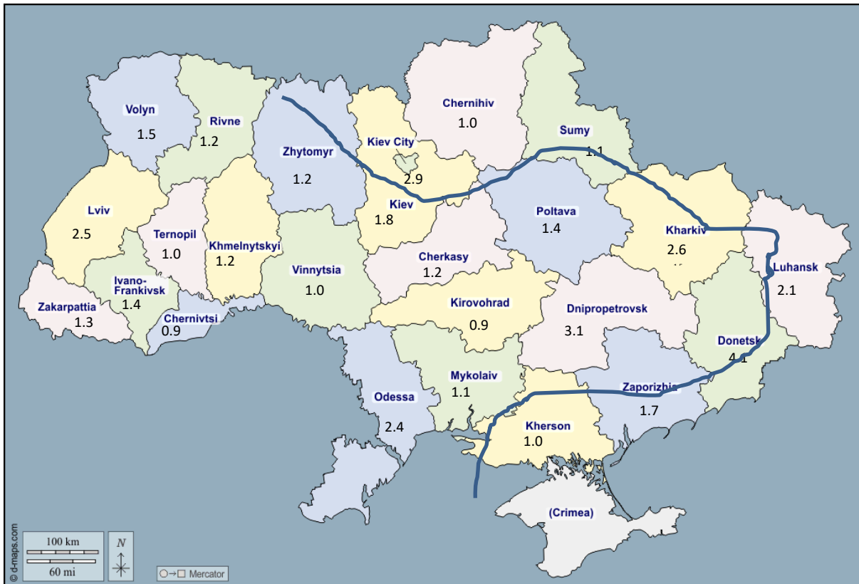
Map: Ukraine, oblasts and population in million, rounded (mio.), oblasts affected by invasion by 8 March 2022.

This paper addresses the question how these different scenarios of military confrontation affect flight and displacement of the population. 1 Ukraine still has a population of 37 million without the occupied and annexed territories, and up to 43 million including the occupied and annexed territories. As has become apparent, Russia aims at cutting through the country from Kiev to Kherson. Therefore, we concentrate on scenario 1a, b and c and for the time being neglect scenarios 2, 3 and 4.